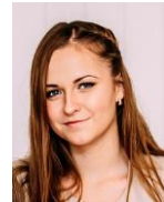
Estonia University of Life Sciences