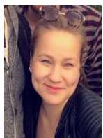
Estonia University of Life Sciences