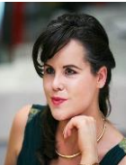
Kosice University of Veterinary Medicine & Pharmacy