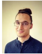
Kosice University of Veterinary Medicine & Pharmacy