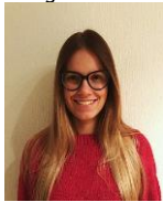
Latvian University of Agriculture