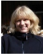
Latvian University of Agriculture