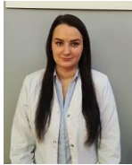
Latvian University of Agriculture