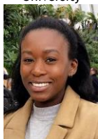
Royal Veterinary College of London