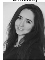
Autonomous University of Barcelona