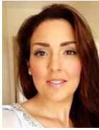
Royal Veterinary College of London